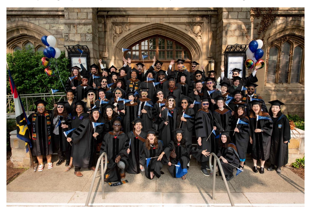
The Class of 2023 at David Geffen School of Drama at Yale.

The pandemic presented the Class of 2023 with many unusual challenges, but nothing could stop this group of exceptional students. They all deserve a standing ovation!